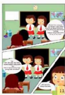
COMIC DESIGN PICTURE

The results of the mathematics comic lks media for grade V SD, namely: a). The Lks produced is feasible to support mathematics learning for grade V SD. ; b). The results of the student and teacher readability test of the fifth grade elementary school math comic strips. The next stage is the learning media validation process. This validation includes material validation, media validation and language validation.