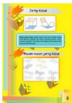
MATERIAL DESIGN PICTURE