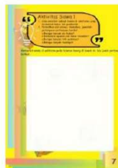
STUDENT'S ACTIVITY PICTURE