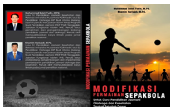
Figure 1. Cover of the Football Game Modification Book.

The prototype of the modified football game book product that was developed includes the size of the A5 book which is designed according to the character of the soccer game modification material presented, the modification of the football game is the result of a modification of the researcher with simple pictures and information so that it is easy to understand, the contents of the book material are the basic concepts of playing, game modification and types of football game modifications with a total of 82 pages. The cover display of the football game modification book in Figure 1 is as follows: